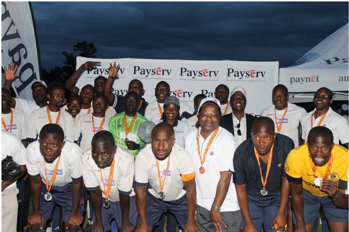
Losing finalists CBZ pose with representatives of tournament sponsors at the grand finale of the 2016 Edition of the Paynet Cup.