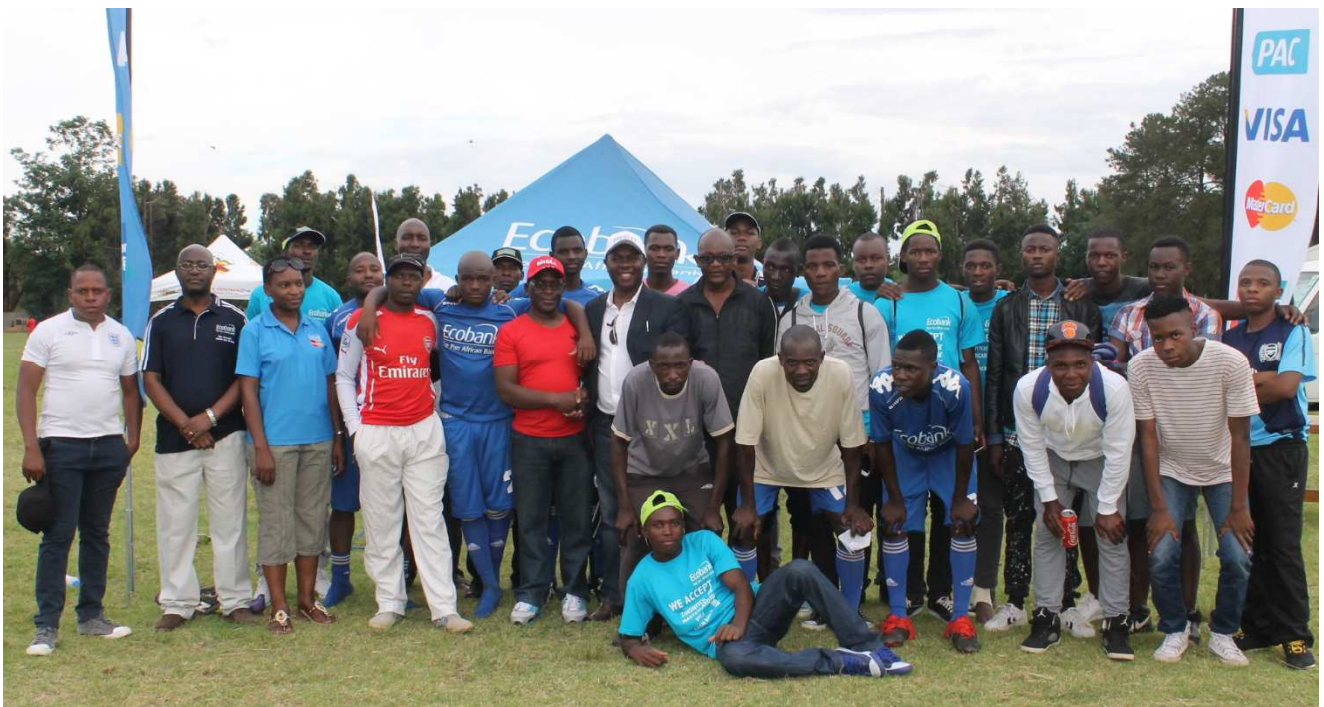
The Ecobank team and supporters at the 2016 Edition of the FSSL Paynet Cup Tournament. Ecobank came 4 th in that tournament.