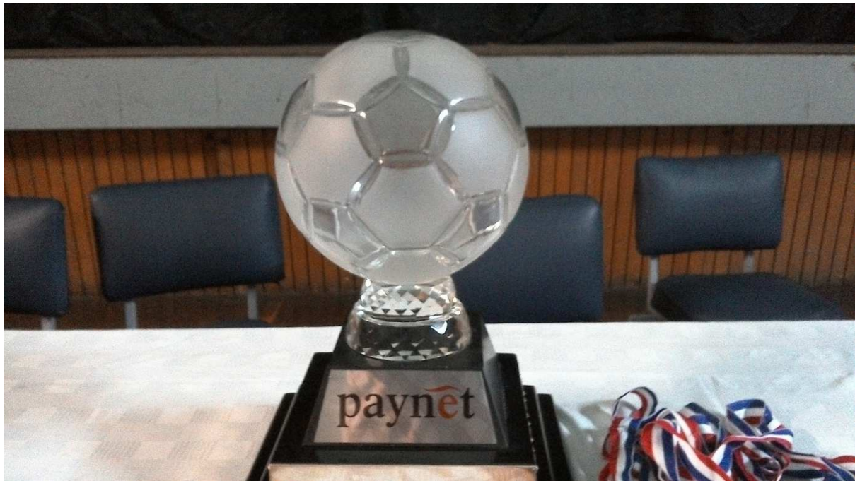
The new Paynet Cup on display during the official launch of the tournament on 28 th October 2017. ZB Bank are now permanent holders of the old trophy after winning it three times.