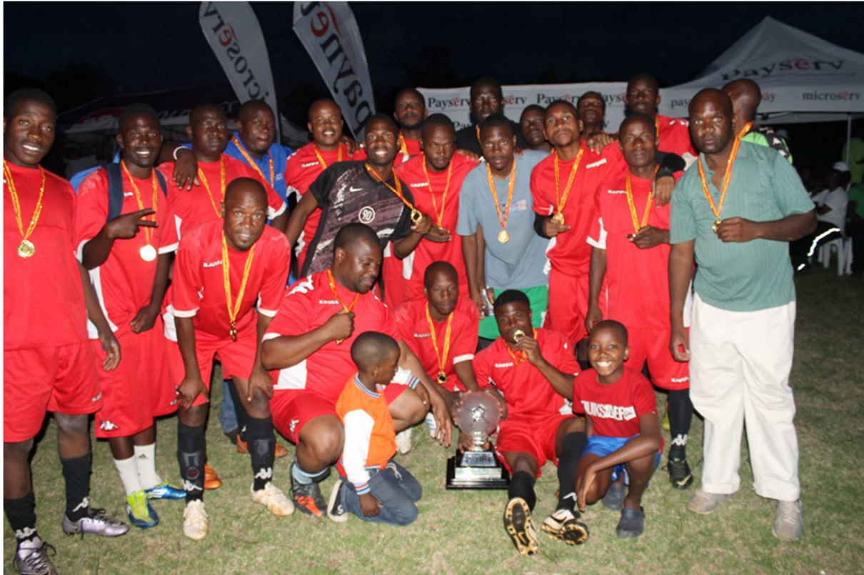
Standard Chartered Bank, winners of the 2016 Paynet Cup pose for a photo with the trophy after beating CBZ 5 - 4 on penalties.