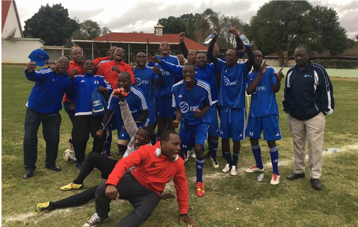
2017 FSSL Champions FBC came third in the 2016 Edition of the FSSL Paynet Cup Tournament.

ET: We encourage all executives to grace the event and support their teams. We also encourage those teams that are not in the league to use the tournament as a spring board to build a team that will also be part of the FSSL league.